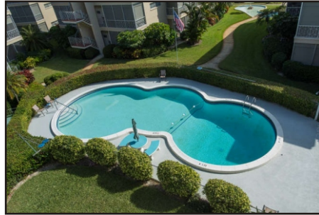
The swimming pool is the centerpiece of the Whispering Waters campus.