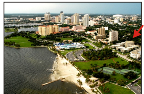
You'll love being part of St. Petersburg's vibrant waterfront community.