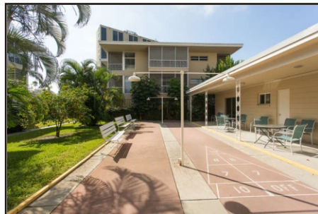
There are great community features, including shuffleboard and laundry room.