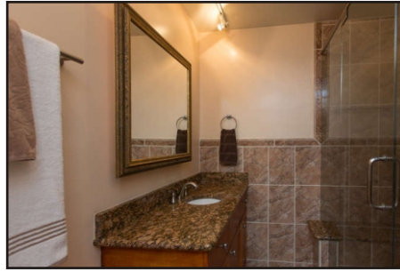
The remodeled bath has a granite-topped vanity, tiled shower and clever storage.