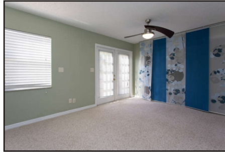
One of three other bedrooms upstairs, which opens out to the large front deck.