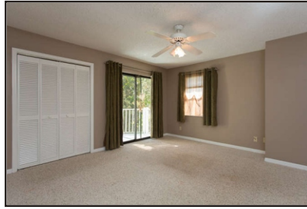
The Master suite features a huge walk-in closet and access to both decks.