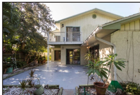
There's great outdoor space, including a patio and a huge fenced back yard.