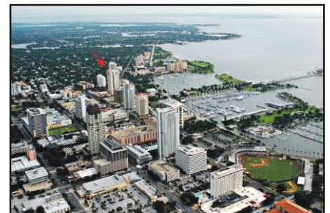
There's a nice patio area to enjoy, and you're just blocks from downtown!