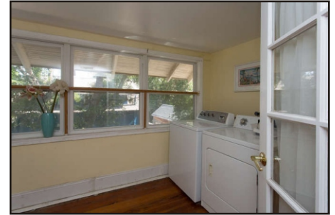
This upstairs bath has great vintage features, and you'll like the 2nd floor laundry.