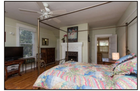
Which bedroom will be the Master? Each of the four has unique features.