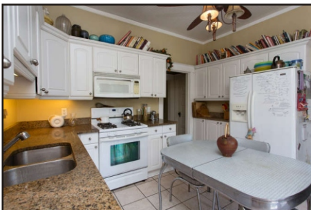
The kitchen has granite counters and a gas range. The dining room is spacious and ideal for entertaining!

You can't beat the location for proximity to the beautiful waterfront parks and vibrant downtown, with restaurants, shopping, museums, galleries and more. See for yourself today how much you'll enjoy living here!