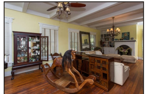
The grand living room with beamed ceiling focuses on a wood-burning fireplace and built-in cabinetry.