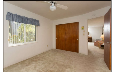
Two bedrooms and a hall bath with jetted tub are on the opposite side of the home.