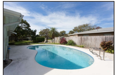
There's a nice screened porch and a solar heated pool.