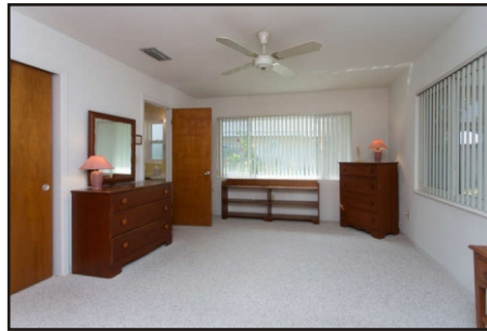
The Master suite features a quirky small bathroom that opens to the garage!