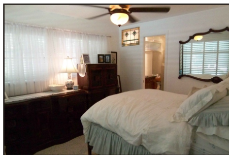
The Master suite enjoys privacy away from the other bedrooms. The remodeled bath has a large shower and a walk-in closet.

*Property taxes may have a significant increase with a change in ownership.