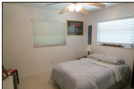
The other three bedrooms are on the opposite side of the home. One of these (above right) has a private bath.