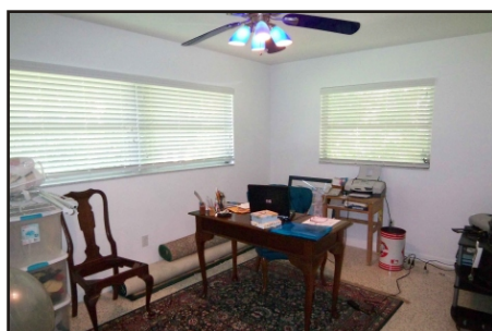
This bedroom is currently used as an office.