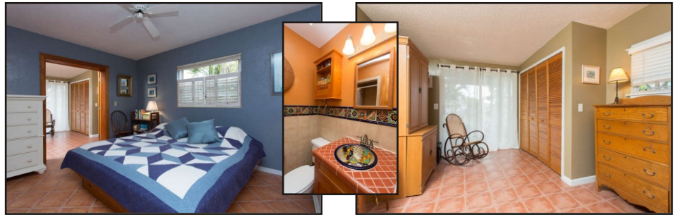
The Master suite has a lovely bath with shower, and an adjacent den/study.