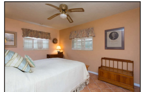
There are two bedrooms besides the Master, on opposite ends of the home.