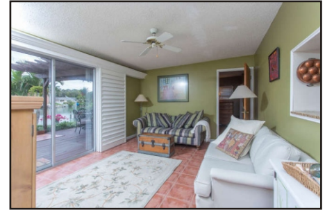
There's lots of flexible space in this home, including two family rooms!