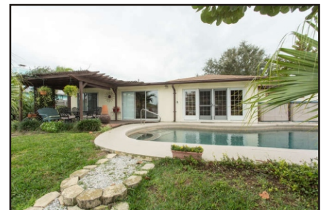
You'll likely spend most of your time outside enjoying the waterfront lifestyle.