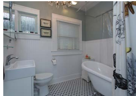
The bedrooms are bright and spacious, and there's a charming hall bath.