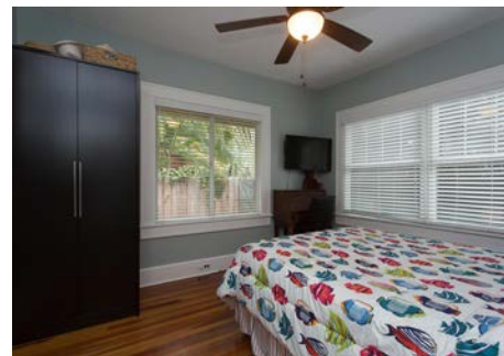
Classic features like this built-in wardrobing add charm (and storage)!