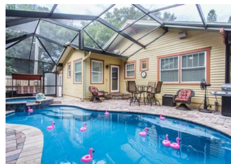
The birdcage screened pool & spa with paver deck is a remarkable oasis!