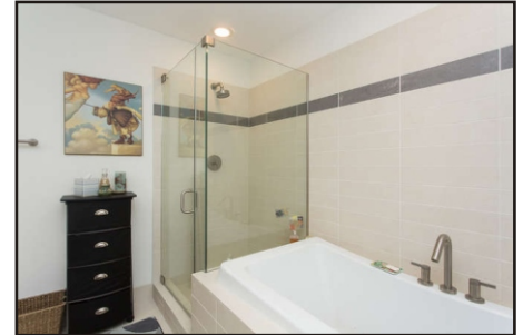
The Master bath has a wide vanity with double sinks, large shower and soaking tub.