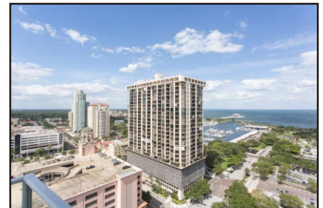
The wrap-around balcony gives you views from sunrise to sunset.