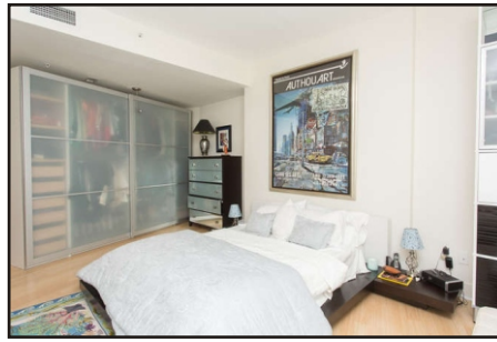
The enlarged Master bedroom has a built-in wardrobe, and opens to the balcony.