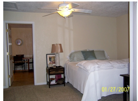
The three photos above are of the 1 Bedroom guest cottage: (L-R) kitchen, living room & bedroom.