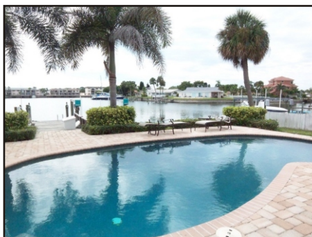
You'll love the paver pool deck, dock with boat lift and tie poles.