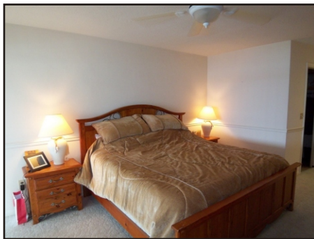
The Master suite has French doors to the lanai, a private bath and walk-in closet.