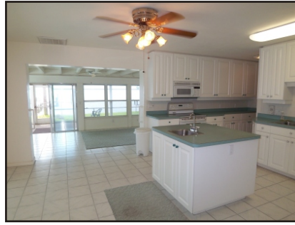
Another view of the kitchen