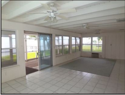
Tiled Florida Room