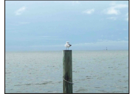
Your New Feathered Friend