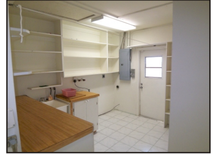
Inside Laundry Room