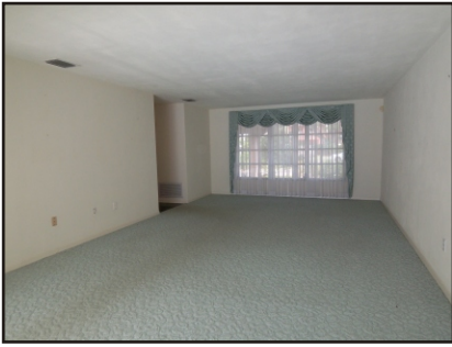
Formal Living Room