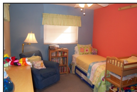
The other bedrooms are across the home, along with a full bath. One of the bedrooms (below) is large enough for office space plus guest quarters.

The neighborhood features a park with a dog area, playground, sports fields, waterfront walking area, and sports track. There's also a community pool that's available as part of the optional homeowner's association. Surrounded by the water, Coquina Key offers the Florida lifestyle that you've been looking for. Make an appointment to see this fantastic home today!