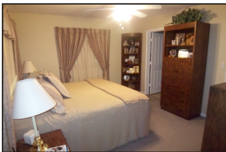
The large Master Bedroom features a private bath and a large walk-in closet.