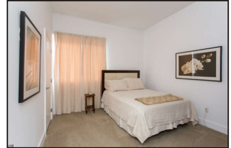
There are two secondary bedrooms, one currently used as an office (above left).