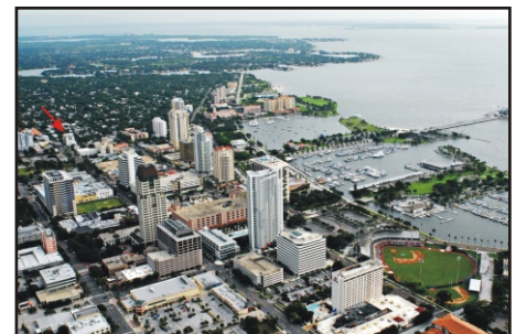
Just two blocks from the waterfront parks, you'll love living downtown!