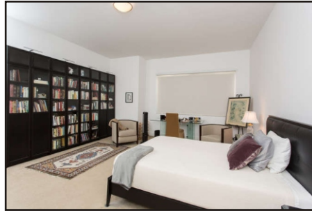
The Master has a large bedroom and a luxurious bath with soaking tub & shower.