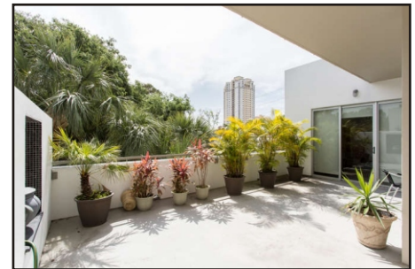
The terrace is enormous by downtown standards, with lots of space to enjoy.