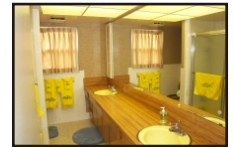
A second bedroom and full bath are in one wing of the home. The third bedroom (below) has built-in entertainment cabinetry.