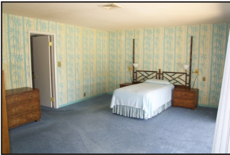
The large Master Bedroom has sliding glass doors to the lanai. There's a walk-in closet and a large private bath.