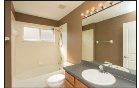
The other two bedrooms have vaulted ceilings and a shared hall bath.