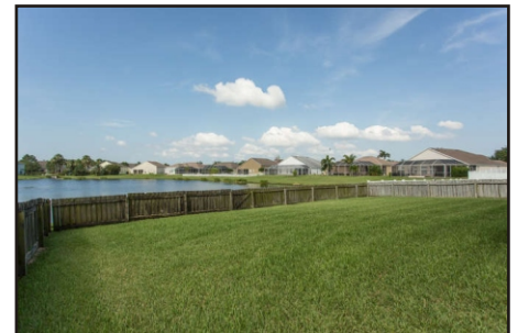
There's a nice screened patio and a huge fenced back yard to enjoy.