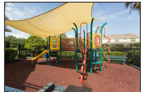
Amenities include a pool, tennis courts, playground and even sand volleyball!