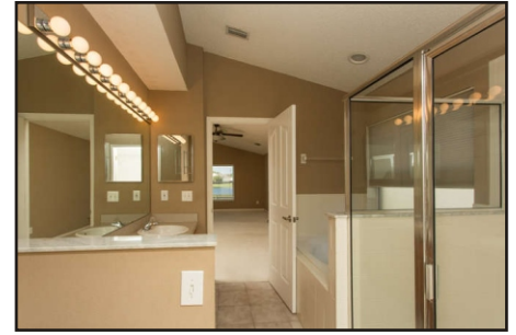
The Master suite features sliders to the patio, a walk-in closet and private bath.