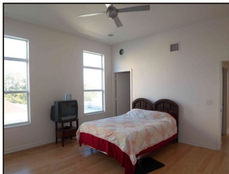
The large Master suite features a private bath with a shower.