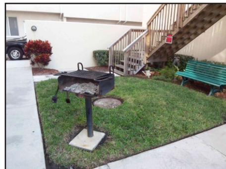
There's a charcoal grill set up so you won't miss your barbecue!