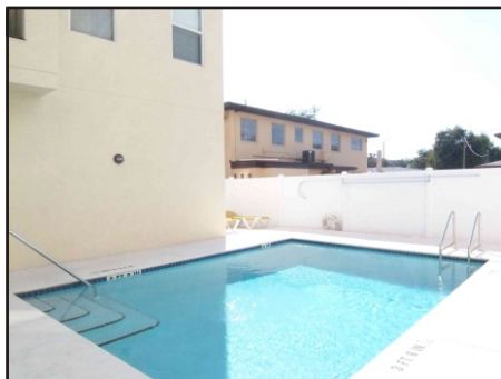
Cool off in the splash pool, or lounge in the sun if you prefer.