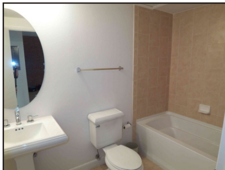
The hall bath is excellent for guests, whether visiting or staying over.