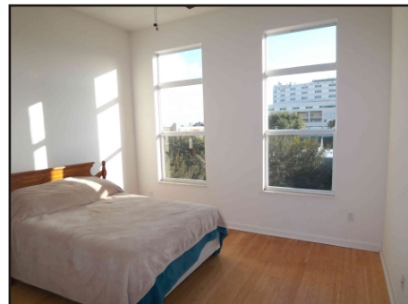
The second bedroom has great southern exposure.