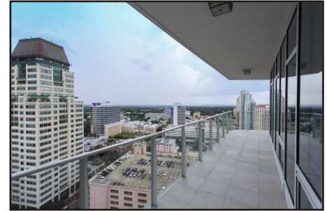
The wrap-around balcony gives you views from sunrise to sunset.