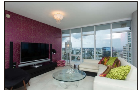
The open floor plan is ideal for relaxing or for entertaining.