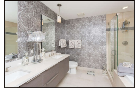
The Master suite has a lavish bath and a walk-in California closet.